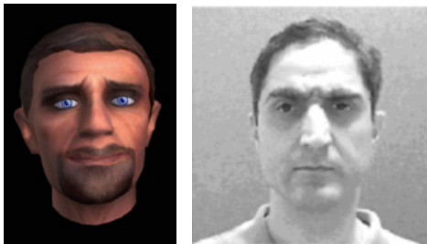
Figure 3. Sample Output Images

<model><event id="user" val="-1" /></model> <story><ser> <talk>Hello </talk> <excl ev_id="user"> <talk ev_val="0">Ali</talk> <talk ev_val="1">Steve</talk> </excl></ser></story>