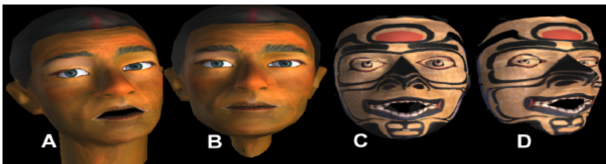
Figure 3. Frames from “storytelling mask” interactive, where a real artist’s voice, passion, stories and expression first introduces himself and his work (A), begins to transform into his artwork (B), has his work tells it’s back story with full voice and expression (C,D) and can return to his persona to interactively answer questions or give other educational content (A).

For this paper however we will concentrate on applications that support more engaging art and science educational systems and we will discuss two ongoing application prototypes where it is hoped that expressive agents can engage the viewer to the deeper or complicated back-story of an artefact or science concept.