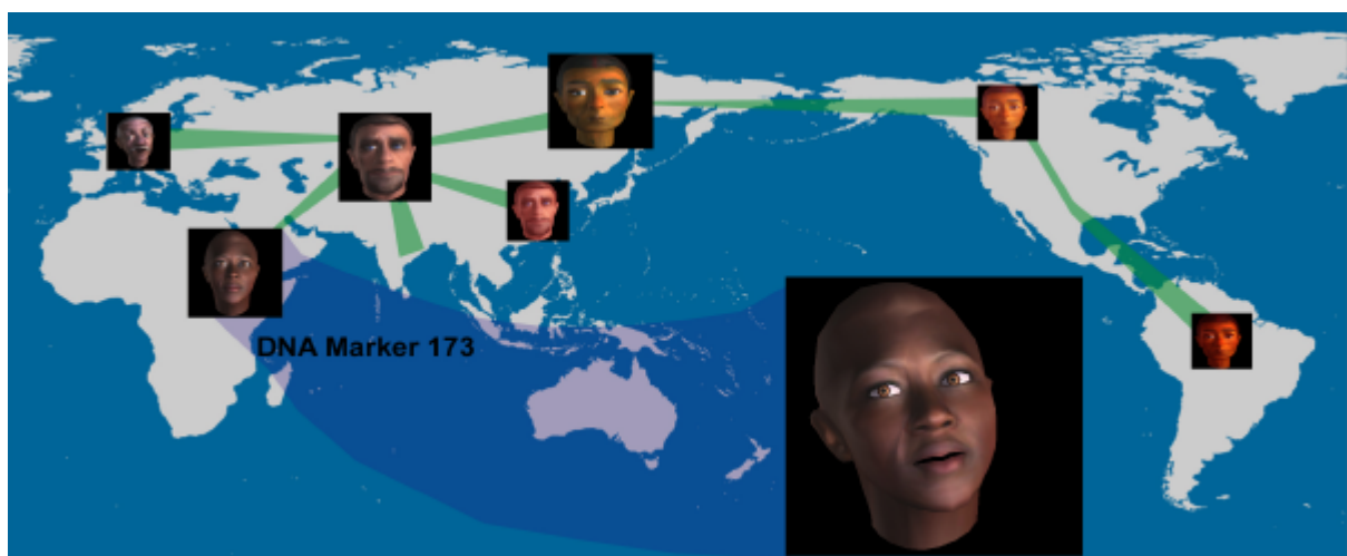
Figure 4. Screenshot of ‘Evolving Faces’ where emotive talking faces describe the DNA science of human migration out of Africa, actively “morphing” facial types accordingly.